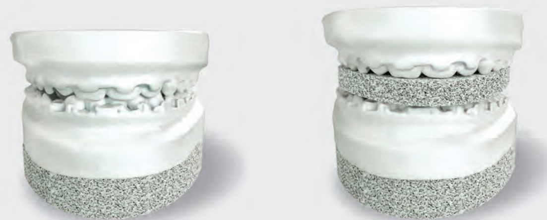
Dental casts of the planned final occlusion

When the patient is wearing braces, make sure the impression material also covers the brackets at least up until the archwire. Please avoid covering the braces or brackets with wax.